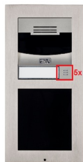
2N® IP Verso