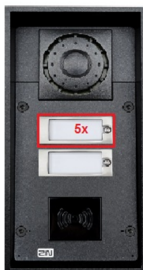
2N® IP Force