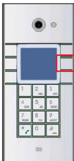
2N® IP Vario

Door & Security Intercoms (Official Website 2N)